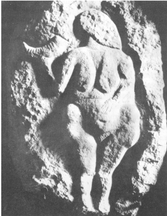
Paleolithic figurine of mother-goddess used in fertility rites (from Çatal Hüyük site, Turkey).