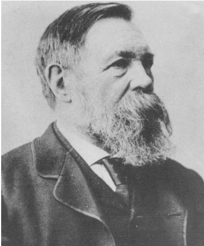
Frederick Engels in the 1870s.