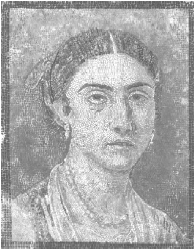
Pompeii, mosaic portrait of a woman (late first century BC to early first century AD).